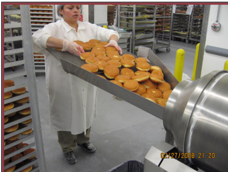
Loading donuts from screen