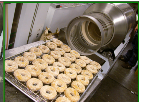
Discharge onto screen