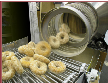
Discharge onto conveyor